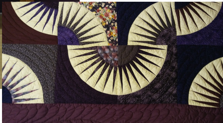
Close up of detail of the quilt.

In the lobby at HCT is a display for a raffle for an hand-made Amish Quilt. Raffle tickets are $10 or 3 for $25, and will be sold during the 2017 shows, with the drawing taking place at the December 12 meeting of the Board of Directors. This beautiful king-size quilt was purchased at an Amish Quilt Auction in Indiana, and was donated to Holland Civic Theatre to be used as a fund-raiser. Tickets can be purchased at Concessions or the Box Office, using cash, check or credit/debit card, or using the form below. If you mail it in, we'll send you your part of the raffle ticket.